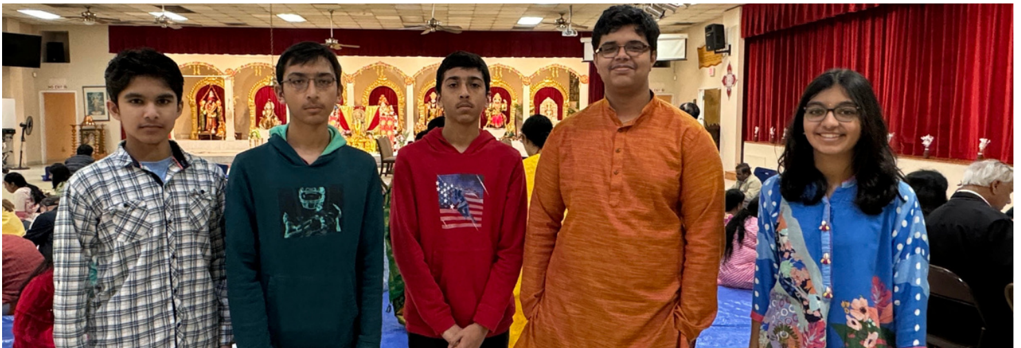
HTS Youth Group volunteers serving at the Saraswati Puja at the temple.