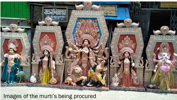
Images of the murti's being procured

Thank you for your participation and A hearty welcome in advance to this year's Durga puja with all new murtis!