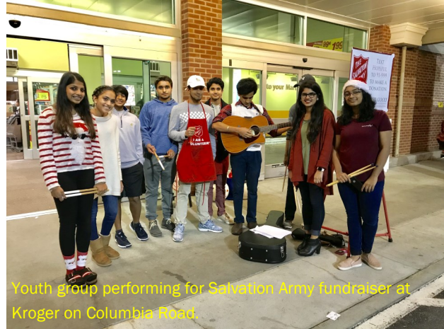
Youth group performing for Salvation Army fundraiser at Kroger on Columbia Road.